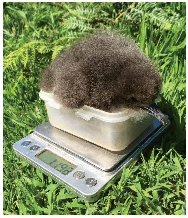
Plate 1. A Manx Shearwater Puffinus puffinus chick being weighed on Skomer Island, Wales.

may be contributing to the global decline of seabirds, a decline which is occurring more quickly than in any other bird group (Lavers et al. 2014).