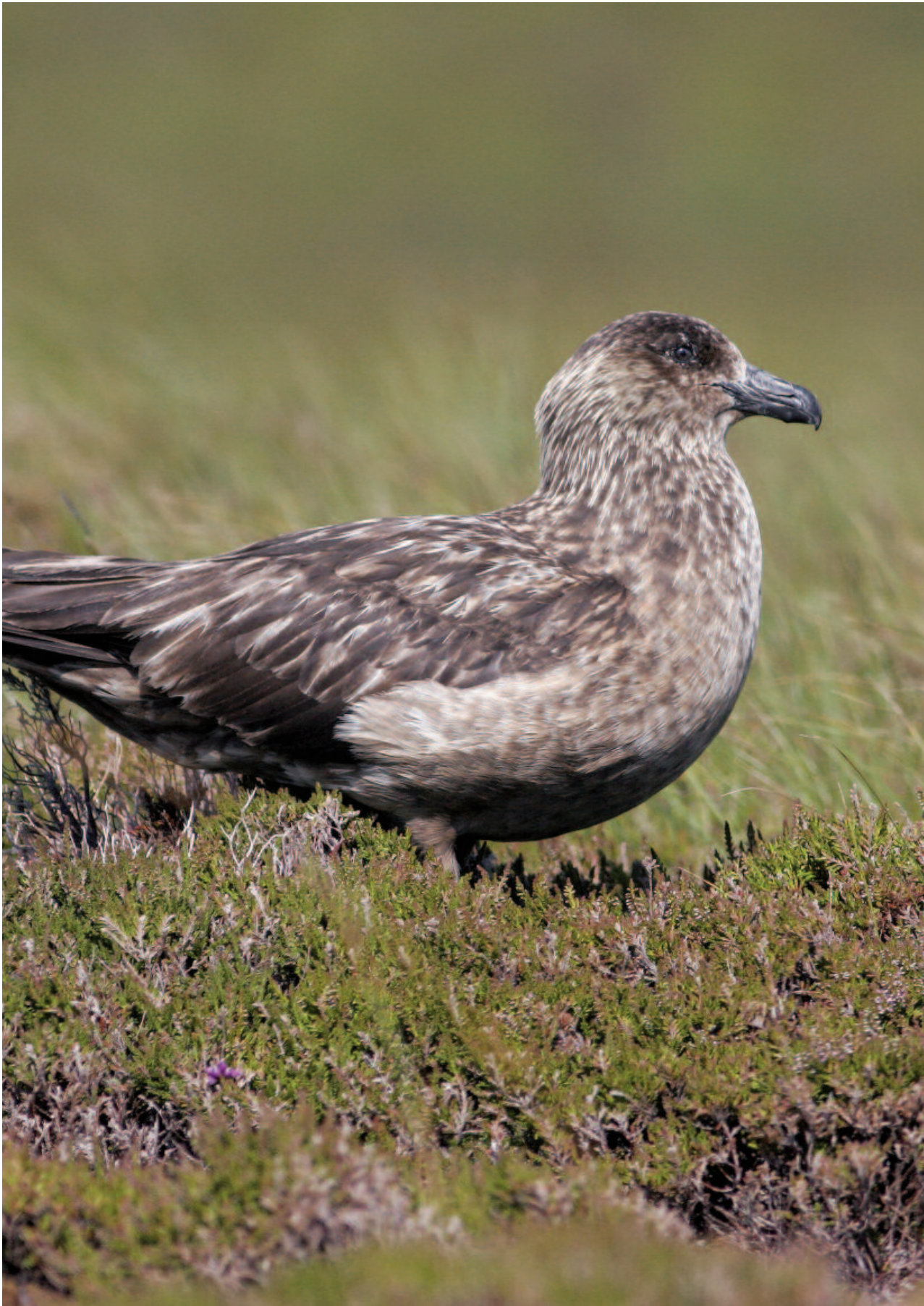
Figure 2. A Great Skua Stercorarius skua on St Kilda, Western Isles, UK.