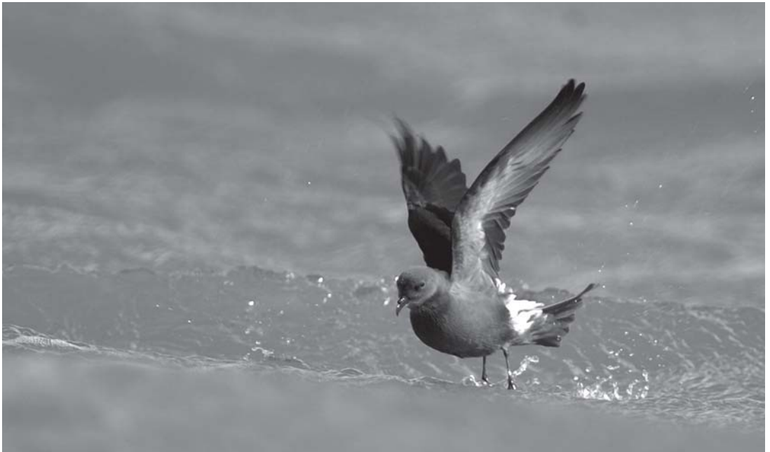
Figure 4. Leach's Storm-petrel Oceanodroma leucorhoa , Merseyside, 23 September 2004 © Sue Tranter.

Leach's Storm-petrel on Sula Sgeir: On Sula Sgeir Leach's Storm-petrels were probably the 'stormy petrels' observed in 1930 by Dougal (1937) and in 1932 by Stewart (1934), as being present in bothy walls. Breeding was proven in 1939 by Atkinson & Ainslie (1940) who found both young and incubating adults. They carried out an overnight survey of the rock, starting from the bothies and surveying southwards to the summit cairn. They found birds calling from underground near the bothies and along the length of the summit ridge (Figure 3). They considered that they were at least as numerous as the population on Rona and estimated that 400 pairs were breeding there. The subsequent loss of soil and vegetation around the bothies, caused largely by the increase in nesting Northern Fulmars, and on the plateau by the expansion of the gannetry, probably reduced the available breeding habitat. As a