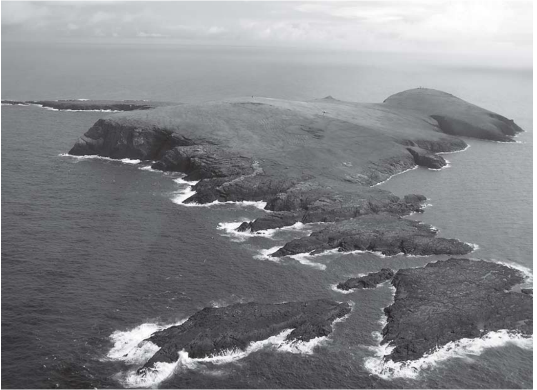
Figure 2. Aerial photograph of North Rona © J. A. Love.

The Toa Rona cliffs (section P) were difficult to access, held large numbers of Northern Fulmars Fulmarus glacialis and Atlantic Puffins Fratercula arctica and vegetation was unstable over shallow soil. Therefore, to lessen risks to surveyors and to minimise disturbance to the colonies, the area was surveyed by a single surveyor only. Overall, the slope was delimited by steep rock walls, narrow gullies and sharply defined vegetation boundaries, which simplified surveying.